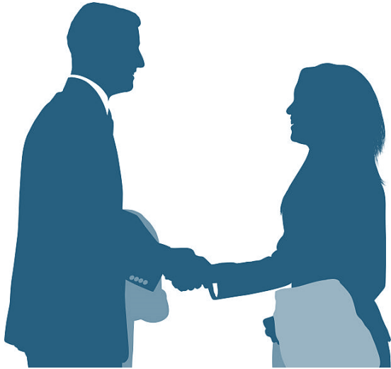
Community of Superhosts