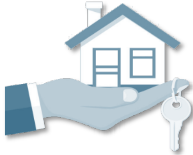
Landlord Analytics Dashboard